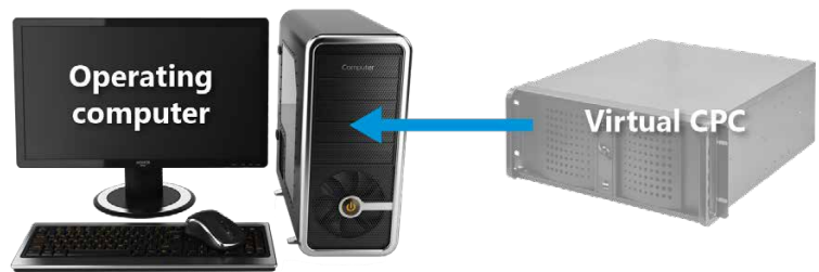
The virtualized real-time computer runs on the control PC, eliminating the need for separate hardware.